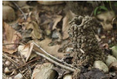
Red Burrowing Crayfish ( Cambarus carolinus ) "castle"

The Red Burrowing Crayfish ( Cambarus carolinus ) is another example of crayfish diversity in the park. One of the park's more brilliantly-colored burrowing crayfish, they live their entire lives beneath a small tower of mud on streambanks called a "Crayfish Castle," where they perform all of life's functions below the waterline. Burrowing crayfish use the small pocket of water at the base of their burrows to keep their gills moist, which allows them to survive in the subterranean environment. Burrowing crayfish will even use mud from their excavation to seal off the entrance of the burrow to prevent desiccation during times of drought.