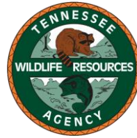
Tennessee Wildlife Resource Agency https://tn.gov/twra/