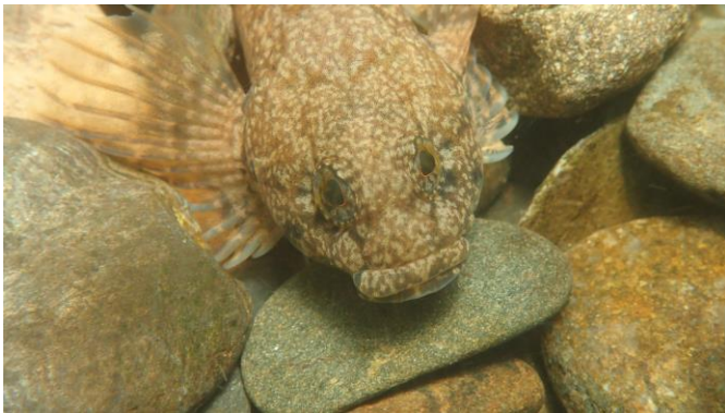
A Banded Sculpin ( Cottus carolinae ) is well camouflaged against a rocky stream bottom.

In 1957, a fish piscicide, rotenone, was added to lower Abrams Creek to remove the many different smaller species of fish that at the time were considered to be pests in an attempt to create a trophy fishery for non-native Rainbow Trout ( Oncorhynchus mykiss ). This reclamation effort eliminated over 30 species of native fishes, but the trout fishery was never established. Starting in 1986, the National Park Service (NPS), Conservation Fisheries, Inc., U.S. Fish & Wildlife Service and Tennessee Wildlife Resources Agency began restoring lower Abrams Creek by reintroducing the federally-listed Citico Darter ( Etheostoma sitikuense ), Smoky Madtom ( Noturus baileyi ), and Yellowfin Madtom ( Noturus flavipinnis ). However, many other ecologically-important fish species are still not present and require assisted reintroductions to restore.