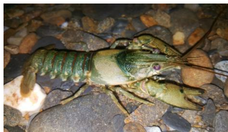
Reticulated Crayfish Orconectes erichsonianus

The Red Burrowing Crayfish ( Cambarus carolinus ) is another example of crayfish diversity in the park. One of the park's more brilliantly-colored burrowing crayfish, they live their entire lives beneath a small tower of mud on streambanks called a "Crayfish Castle," where they perform all of life's functions below the waterline. Burrowing crayfish use the small pocket of water at the base of their burrows to keep their gills moist, which allows them to survive in the subterranean environment. Burrowing crayfish will even use mud from their excavation to seal off the entrance of the burrow to prevent desiccation during times of drought.