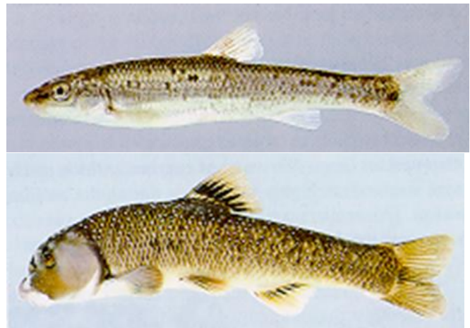
Above: Central Stoneroller ( Campostoma anomalum ) Below: C. anomalum breeding male

The Central Stoneroller ( Campostoma anomalum ) is abundant in both small streams and large rivers in Tennessee. The males can reach a length of 12 inches (30 cm). Their preferred habitat is gravel bottomed streams, where males will build a nest for spawning by rolling stones with his mouth. These large mounds of stones can be seen in early summer as other, often more colorful, fishes gather on them to also spawn or feed on the eggs. Some anglers have dubbed them “Hornyheads” in reference to tubercles on a sexually mature male’s head, which resemble little horns. The tubercles are used to defend their nest from other males, although the Stoneroller will allow the nest to be used by other fish species.