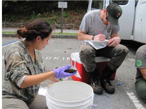
Left to right: GRSM fisheries staff electroshocks a stream to collect fish samples. GRSM fisheries staff label and record samples to be processed and analyzed by USGS personnel.

Game fish were the focus of this study in GRSM partly because they generally are top predators in stream food webs. This trophic placement makes them the endpoint for the bioaccumulation of toxins such as mercury. Game fish are also the species most likely to be consumed by humans, making them of particular interest in regards to human health concerns associated with mercury. If this study determines mercury levels exceed human health standards, consumption advisories will be placed upon these species and locations. Results from western U.S. parks have already been reported and are available at: