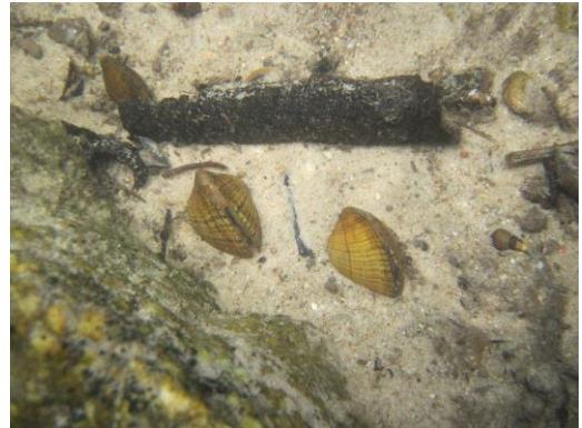
Wavy-rayed Lampmussel ( Lampsilis fasciola ) in Abrams Creek

Of the 133 species of freshwater mussels historically found in Tennessee, at least 45 have been designated as Endangered under the Endangered Species Act and at least 16 species are believed to be extinct. These losses are mainly due to competition with invasive species, overharvesting, habitat degradation or loss, sedimentation, and poor water quality. Surveys conducted in 2016 and 2017 documented 5 different species in Abrams Creek at and near the impounded section of Chilhowee Reservoir with the most common species observed being the Rainbow Mussel ( Villosa iris ) and the Cumberland Moccasinshell ( Medionidus conradicus ).