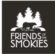
Friends of the Smokies https://friendsofthesmokies.org/