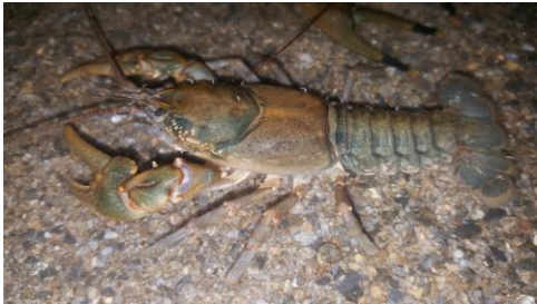
Common Crayfish Cambarus bartonii bartonii

As the name implies, the Common Crayfish ( Cambarus bartonii bartonii ) is the most often encountered species. The range of this species spans the entire park and is the only species to be found in the lowest elevation streams such as the Pigeon River or Little River, all the way into the park's headwater streams.