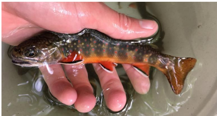
Brook Trout ( Salvelinus fontinalis )

These restoration efforts added 4.0 miles (6.4 km) of stream to the Brook Trout's current range in the park. These efforts will provide additional opportunities for anglers to target these beautiful species in the GRSM. Thus, the Brook Trout restoration projects of 2016 and 2017 enable the NPS to embody its mission of preserving and protecting native species, while providing additional opportunities for the public to enjoy the native trout of the Smokies.