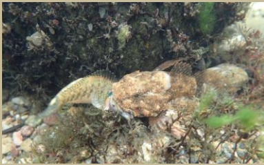
Banded Sculpin ( Cottus carolinae) eating Redline Darter ( Etheostoma rufilineatum)