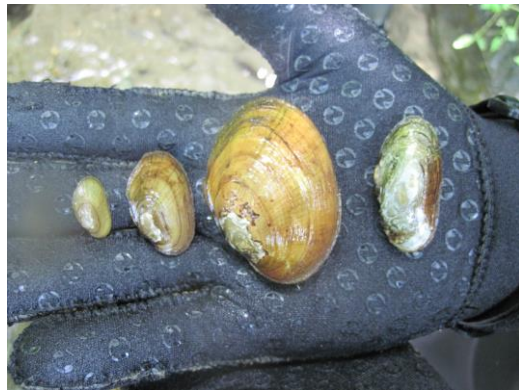
Several common mussel species found in 2017 snorkel surveys of Abrams Creek.