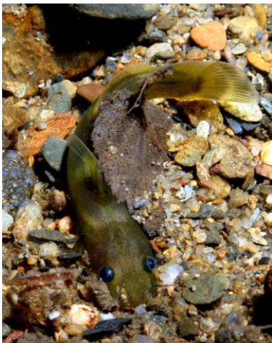
Smoky Madtom ( Noturus baileyi )

Smoky Madtoms are a skittish, nocturnal species that can reach a maximum length of 3 inches (73 mm). They usually occupy riffle and run portions of the stream from summer to fall and gentle runs and pools in winter through spring. They can be found in gravel and cobble substrate with small boulders. During the spring, females will lay eggs under these boulders and leave the male to protect the eggs. Similar to other species, they may abandon the nest if it is disturbed, such as by rock dam or channel construction by people.